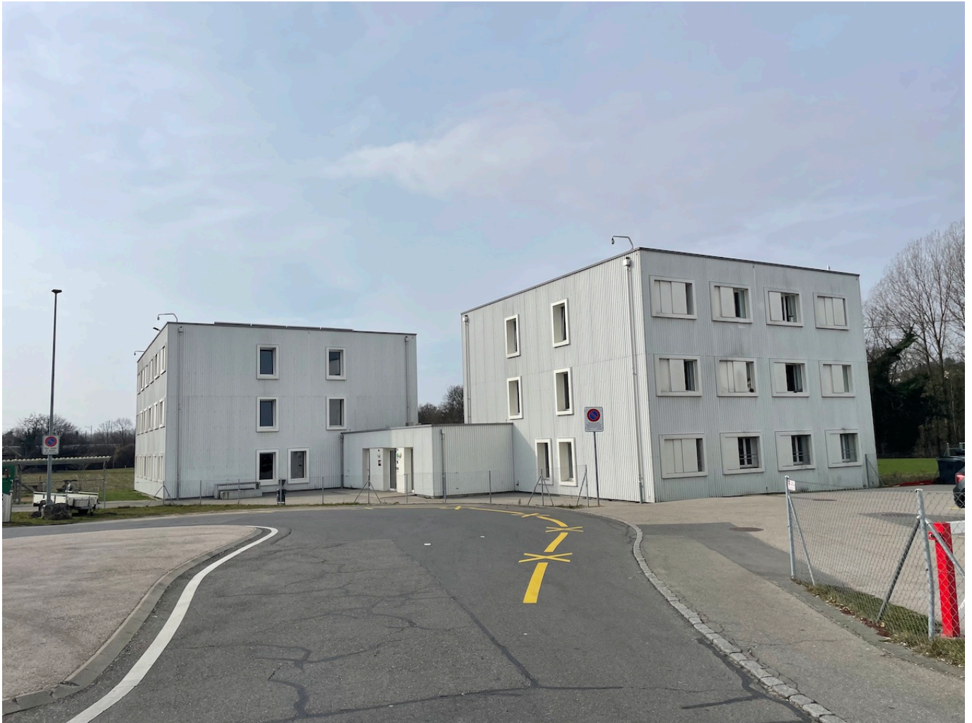
One of the EVAM buildings in Ecublens

Konstantin leads me to the room where he lives alone (“I’m lucky!”) and shares a bathroom with a couple of refugees from Odessa. He has divided his space (some 24–25 m 2 , by the look of it) into several sections: “studio, gallery, bedroom, kitchen, and dining room,” as he describes his temporary belongings with a broad smile. “Everything is very well organised. There’s an Aldi one minute away on foot, where you can buy everything you need. The allowance I receive is enough for me, because I only spend it on food. Public transport is free, but only to Lausanne, not to Geneva. Medical care is also free. The only real difficulty is buying art supplies: the specialist shops are far away, but in principle you can get there. Once a week, a kiosk opens where you can obtain second-hand clothing free of charge. Shoes are a problem for me, because not all of them are suitable for my prosthesis. Sometimes I go to Morges. My student card (I’m taking a French course) gives me discounts for museums. So all in all, it’s fine.”