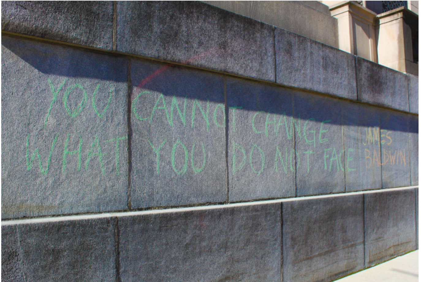
Graffiti with an inexact quote from James Baldwin at a manifestation in support of George Floyd in Indianapolis, 2020

In March of this year, the Federal Service for Combating Racism (SLR) released a report in which it acknowledged for the first time the existence of systemic racism in Switzerland, in several areas. This awareness now calls for concrete actions and perhaps partly explains the decision by the Kunsthhaus in Aarau to organize an exhibition on the subject of racism, built around the African-American writer James Baldwin (1924-1987); he is considered by many participants in the "Black Lives Matter" movement as their ideologue and spiritual leader - even if they don't always quote him accurately.