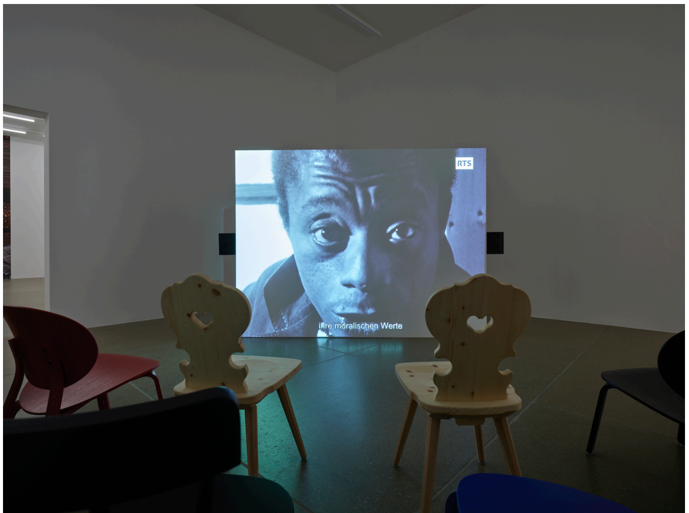
Pierre Koralnik. Stranger in the village, 1962. With James Baldwin

The multitude of people one meets in life can easily be divided into two groups: those who lift us up and those who drag us down. The first group outweighs the second, and the earlier we choose it, the more interesting and fulfilling our existence becomes. In my youth, I had the incredible fortune of meeting many exceptional people who influenced me. James Baldwin is one of them.