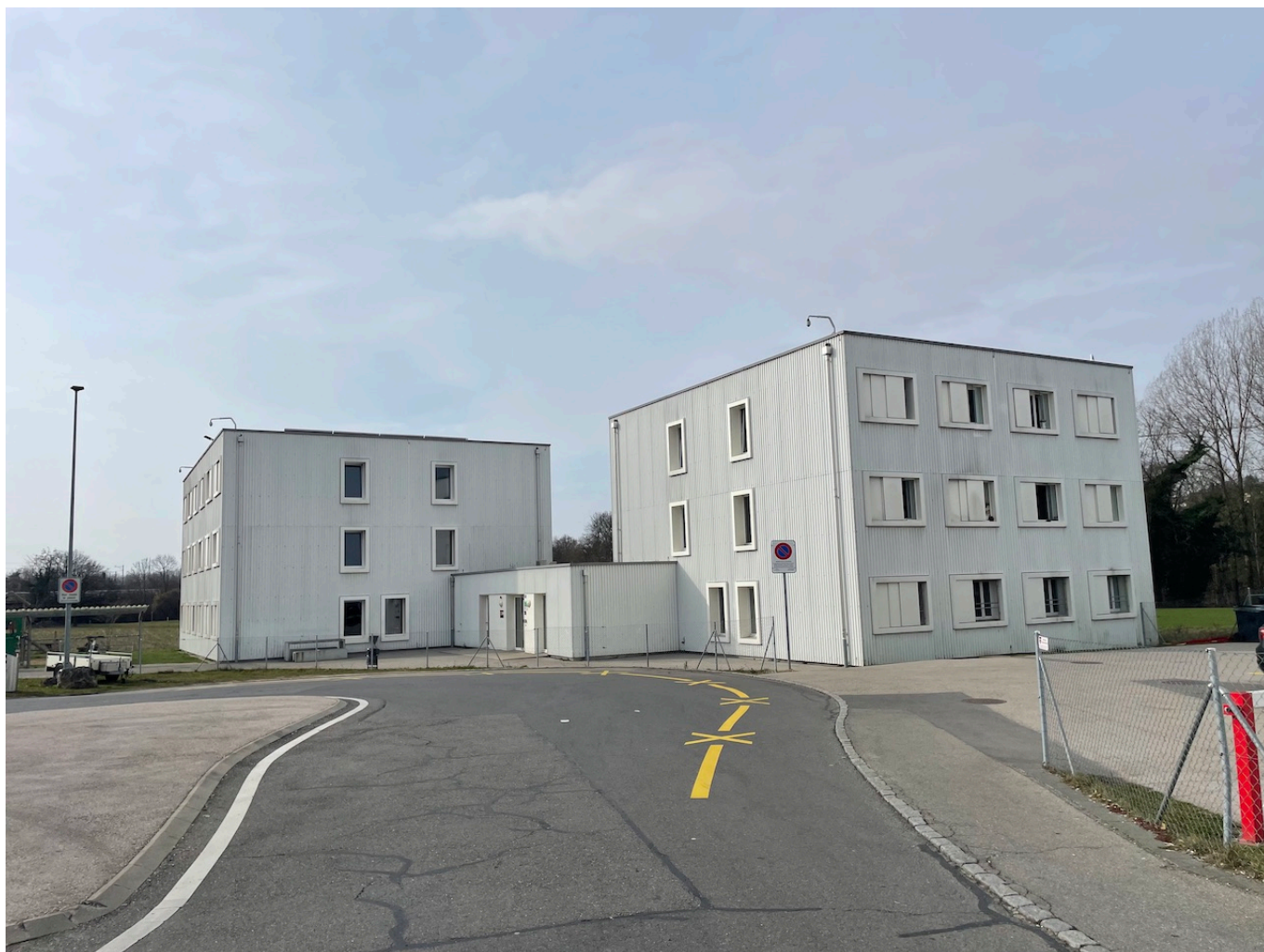
One of the EVAM buildings in Ecublens

Surrounded by large supermarkets and companies, mainly in the automotive sector, it gives no hint of its function. Just another residence, like many others. Only when approaching the entrance does one notice a pink sign reading: EVAM – Établissement vaudois d'accueil des migrants. To the left of the entrance sits a security guard, to whom one must show an identity document. "Konstantin is calm, there are no problems with him. If everyone were like that, I wouldn't even be needed," he says kindly as he hands my ID back to me.